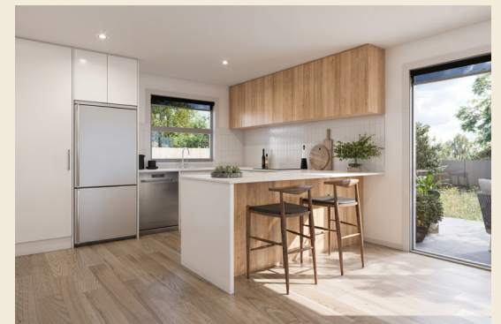
Kitchens have great layouts, with a premium fit-out.