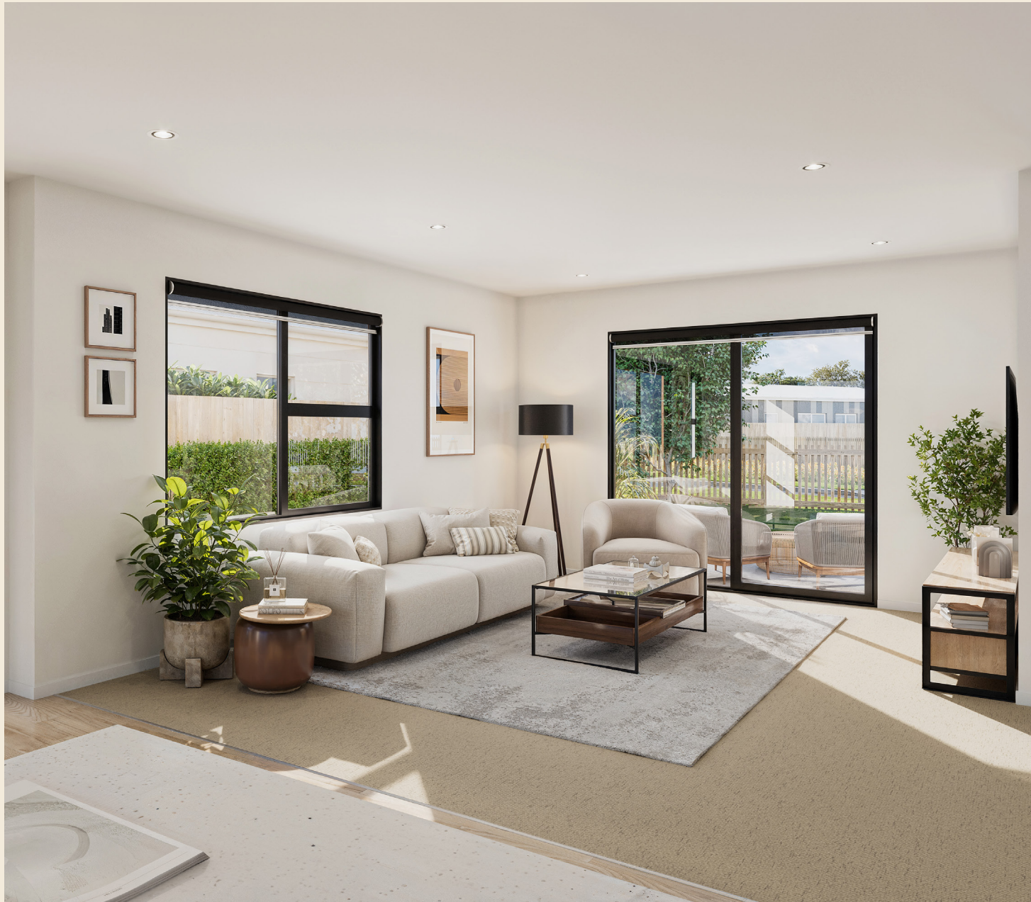
All homes offer spacious open-plan living, and excellent connection to the outdoors.