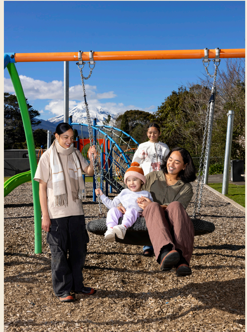
The neighbourhood is adjacent, and connected to the Ōkato Skatepark and playground, with your Tūpuna Maunga beyond.