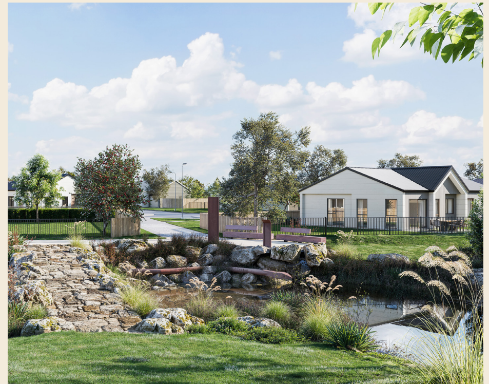
The project also enables a rejuvenation of Te Mangaone Stream with a weir, wetlands, sculpture, seating and pathway incorporated.

A beautifully detailed site has been created under the expert eye of blac projects, with cultural narrative detailing throughout.