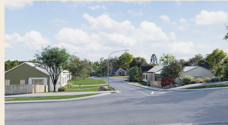
The entrance into Te Katonga Nui from Carthew Street

Located in the coastal township of Ōkato, Te Katonga Nui is located next to the Ōkato Playground and Skate Park (with frontages on SH45 and Carthew Street). Formerly home to Ōkato School, but vacant since 2004, Te Katonga Nui has been developed by Taranaki Iwi Holdings Limited Partnership (TIHLP) after purchasing the land from Crown as part of the Taranaki Iwi Deed of Settlement process. Te Katonga Nui represents a post Settlement priority for the Trust in responding to a significant need for affordable, quality homes for whānau in the New Plymouth region.